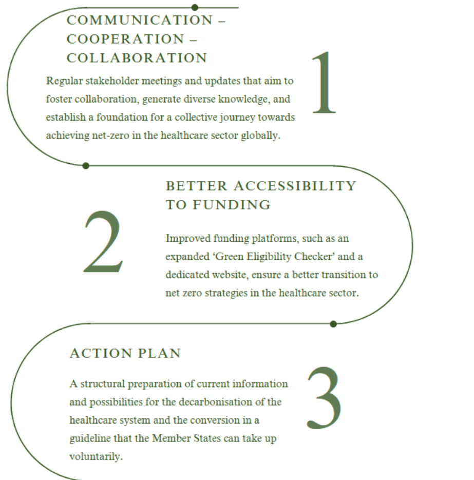
Figure 3. Three-step process (developed by the authors)